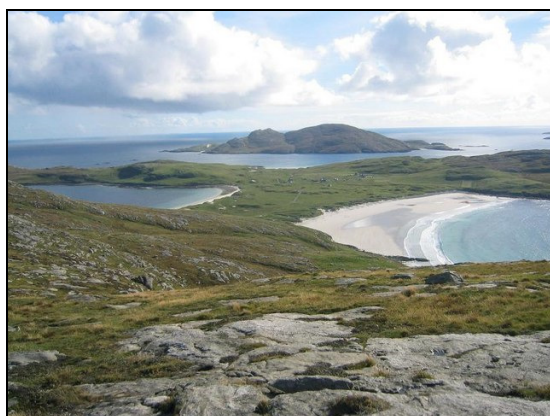
View over Vatersay to Sandray

The main thing which has changed in their daily life is the availability of electricity for power and running water.