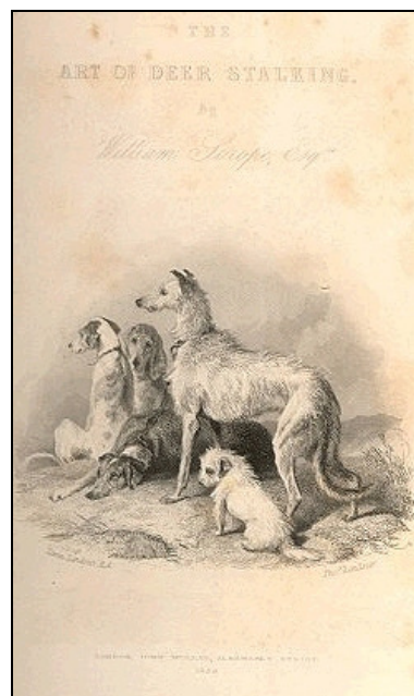
The deerhound pictured above is the MacNeill's Buscar

The MacNeills bred for performance, as well as tradition. They coursed the Red Deer stag on the Isle of Jura, testing their hounds in their traditional moment of truth