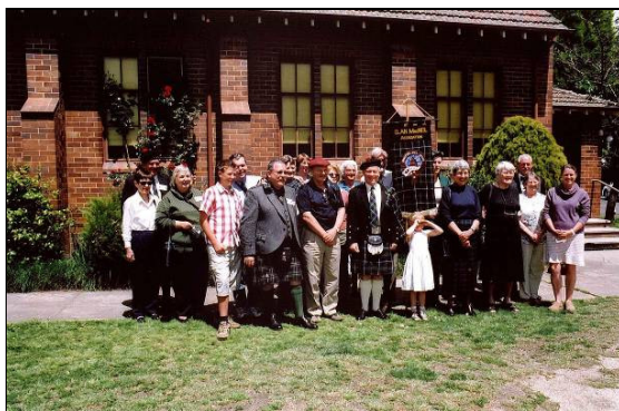
Group picture from the last clan gathering at Mittagong

Our next national clan gathering at Mittagong, NSW – 28 th to 30 th October 2011