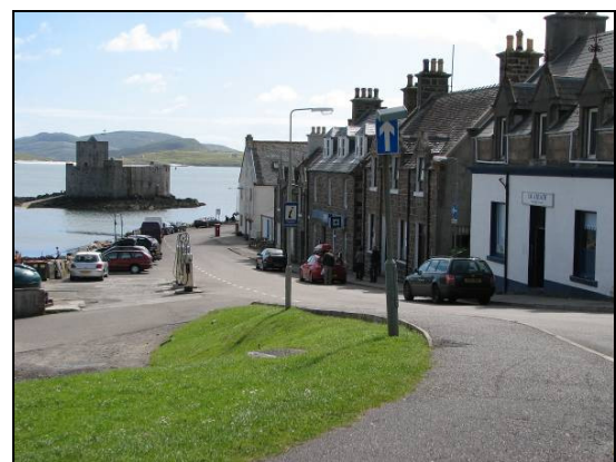
Kisimul castle viewed from Castlebay village

World clan gathering on Barra August 2012